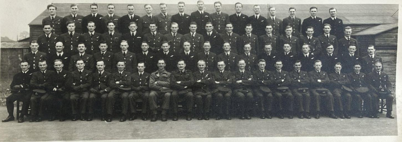
Photograph by VIVIAN'S

Sea Rescue Squadron; my great grandfather circled.