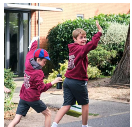
Year 6 Leaver's Hoodies